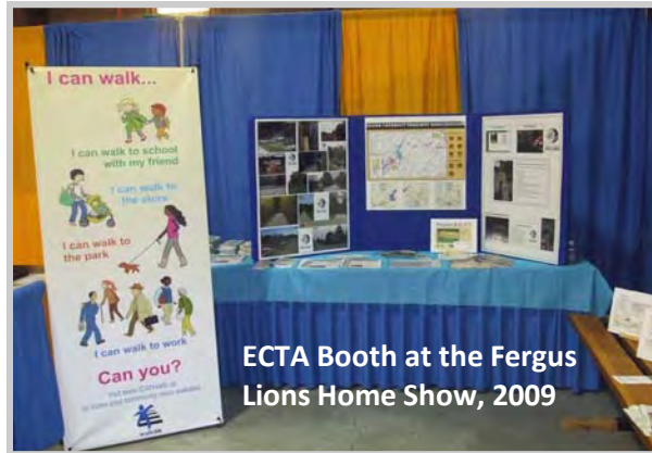
ECTA Booth at the Fergus Lions Home Show, 2009